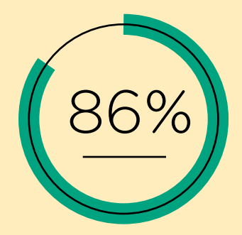
86% of employees would leave their current job for greater professional development

According to a 2019 study by The Execu|Search Group,